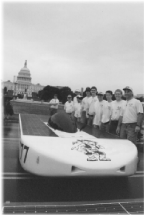
TECHFact: Tech and their solar-powered vehicle, Dakota Heat, qualified to compete in Sunrayce 99 - a 1,300-mile solar-powered race from Washington, D.C. to Orlando, Florida. The team placed 25th overall. The students design, build, and race the solar car.

For program supervision purposes, the MES Ph.D. Program Coordinator is the Graduate Advisor until the Major Professor is appointed. The Major Professor is the person responsible for the student's dissertation research. The Graduate Office representative on the student's dissertation committee must be selected from outside of the department with which the Major Professor is affiliated, and should also be a member of the MES Ph.D. Advisory Council. The MES Ph.D. Advisory Council must approve all programs of study. It is not necessary that the student be associated with the department of affiliation of his or her major professor. The detailed information on examination policy, admission to candidacy, and defense of dissertation are included in the SDSM&T Materials Engineering and Science Ph.D. Handbook.