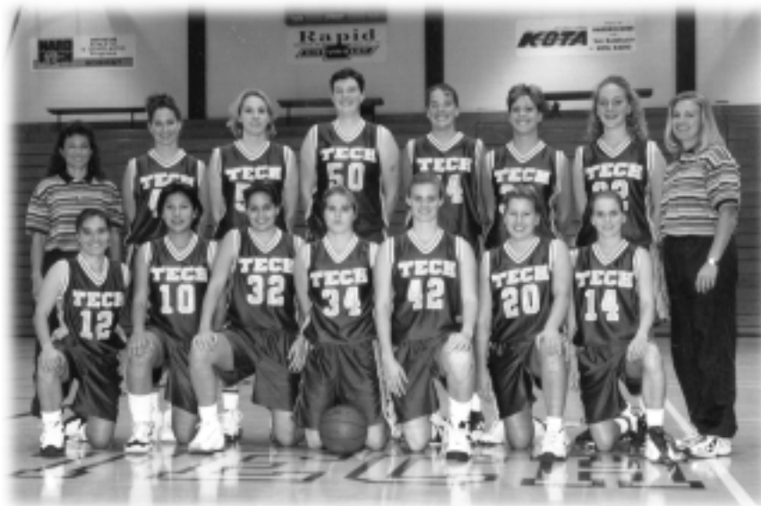
TECHFact: The women's basketball team reached the NAIA Final Four in the 1998 and 1999 tournaments.

The South Dakota School of Mines and Technology has a variety of computing platforms available. Resources include an extensive PC network, a Linux lab, and a lab equipped with SunRays tied to three Sun Enterprise 450 servers. Other computing resources may be accessed via the Internet. The institution encourages its students to use the computer facilities in the creative and efficient solution of scientific and engineering problems.