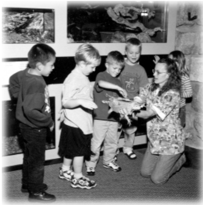
TECHFact: Student organizations and teams volunteer and build exhibits for the Children's Science Center, a university outreach program located in downtown Rapid City.